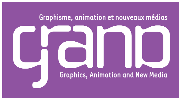
White on a solid colour background